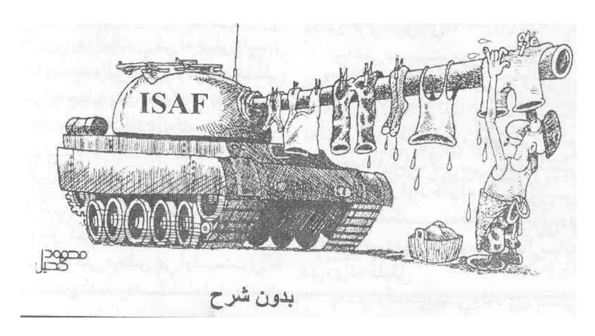
Cartoon from Tulu-e Afghanistan, 14 April 2004. "No comment," reads the caption.

for more than three-quarters of the world's opium supply. This marked a sharp rebound from the near eradication of poppy production during the last year of Taliban rule in 2001, when Afghanistan is believed to have produced less than 5% of this amount. A further production increase of 30% is projected by some sources this year. Poppy is now present in 28 out of the 32 provinces, expanding to areas with no history of previous involvement. Approximately 7% of the Afghan population is thought to economically benefit from poppies in some way, with farmers earning an estimated $1.02 billion in 2003, and 15,000 opium traders and traffickers earning another $1.3 billion the same year. Revenues from narcotics increasingly help bolster the authority of some factional commanders, as they and other local authorities make millions from the trade through their "taxes." Narco dollars are also having a corrupting influence on the central government as there are numerous reports of senior government officials being linked to narcotics trafficking. Even the Taliban and their allies are believed to have derived as much as $150 million in opium revenue in 2003. 15 The drugs trade thus presents a grave security dilemma. Dismantling the industry would help diminish the influence of factional commanders and the Taliban, and enhance the authority of the central government. At the same time, however, a substantial and increasing segment